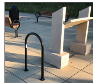
Bike racks for Cardinal Greenway

Wayne County Cardinal Greenway: To purchase 10 bicycle racks to be placed at trailheads in the Wayne County portion of the Cardinal Greenway.