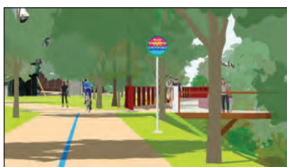
Broad Ripple Riverwalk Promenade