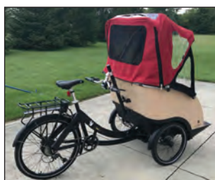
Cycling Without Age

Please watch for your opportunity to give.