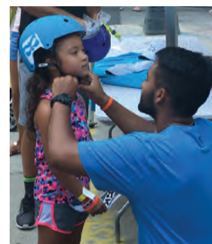
Indy Crit helmets